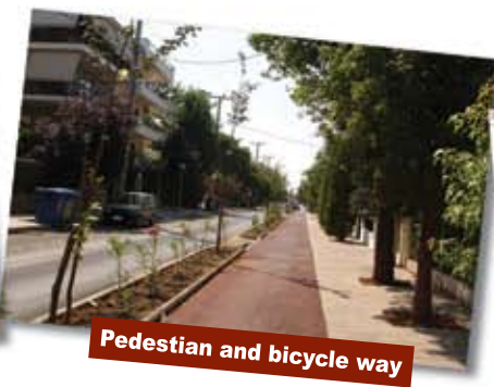
Pedestrian and bicycle way