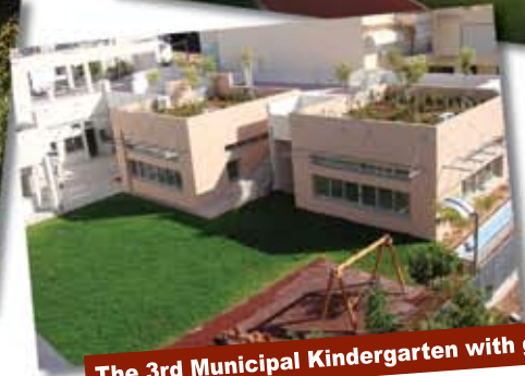
The 3rd Municipal Kindergarten with green roof.

Since 2000 the Municipality of Vrilissia has been applying projects and programs concerning bioclimatic planning both in buildings and open spaces and also ways to reduce energy waste and cost.